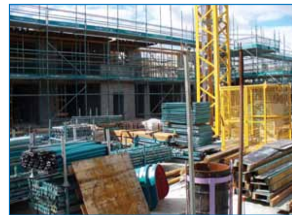
The podium between the apartments and the bowling greens is a handy storage area

Another indication of the attention to detail that has gone into the terrace apartments is the installation of a new water treatment plant for the estate's bore water.