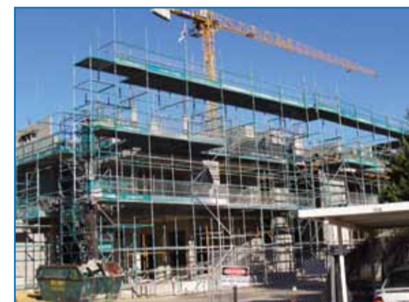
The north east corner takes shape

This is expected to minimise or eliminate the prospect of water staining on the new apartments and surrounding areas.