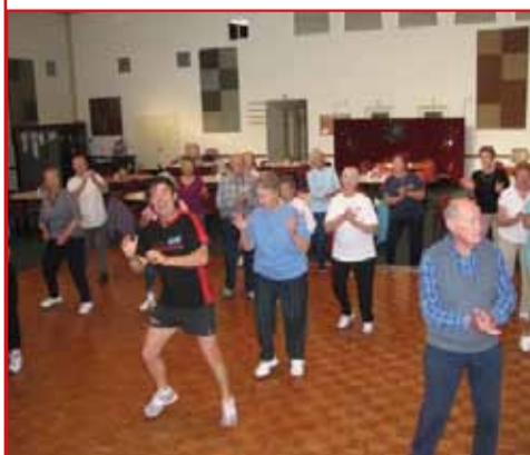
Residents enjoying being "on the move"

As you can see it is thoroughly enjoyed by many of the residents on the estate and is a great way to keep us all "on the move", out of the house and out there meeting people.