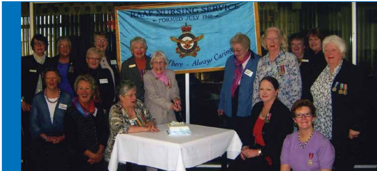
RAAFNS (WA Branch) enjoying the anniversary lunch