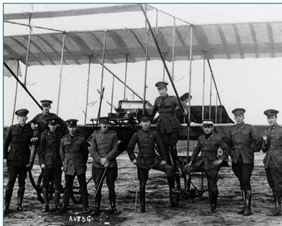
Bristol Box Kite

In England during 1917 No's 5, 6, 7 and 8 Squadrons, AFC, were formed as Training