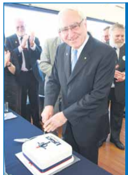
The Governor cutting the cake at the official opening