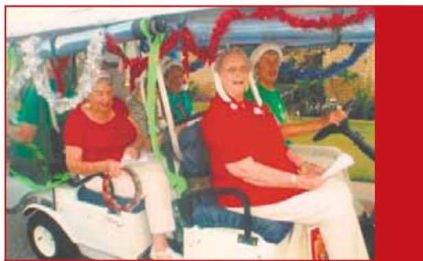
Carollers at Merriwa

Father Christmas and his helpers were seen travelling around the RAAFA Estate Meadow Springs on Christmas eve, getting into the spirit of things, spreading Christmas cheer and singing carols.