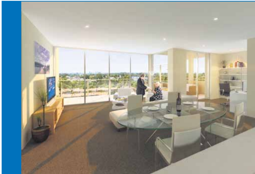
Illustration of typical interior layout

RAAFA's brand new terrace apartments under construction in Bull Creek offer complete privacy and security while being part of an active and established retirement estate where personal independence is respected and protected.