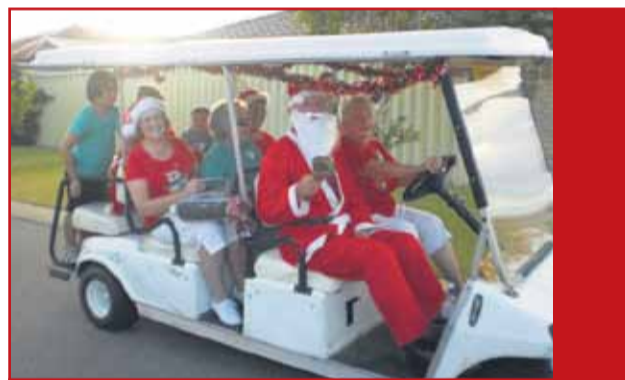
Santa and his helpers at Meadow Springs