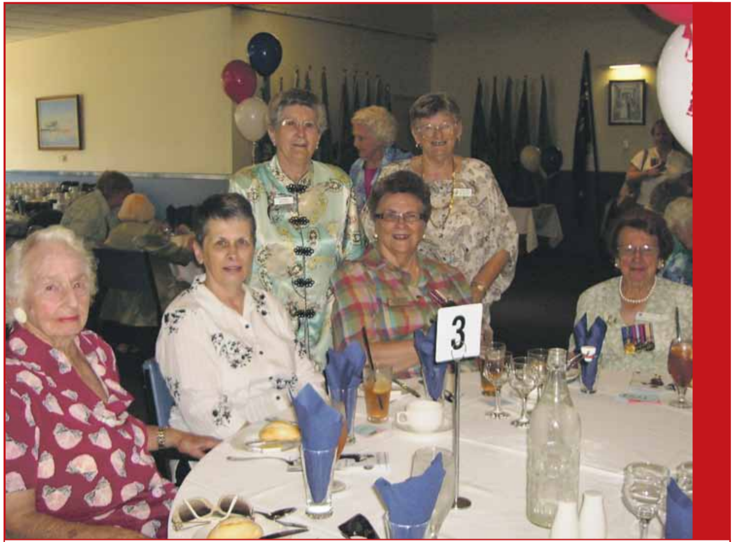
WAAAF ladies enjoying the celebrations

WAAAF Branch WA had been planning this occasion for over 12 months and had a special souvenir mug designed to be given to everyone attending the lunch. WAAAF Branches in other States