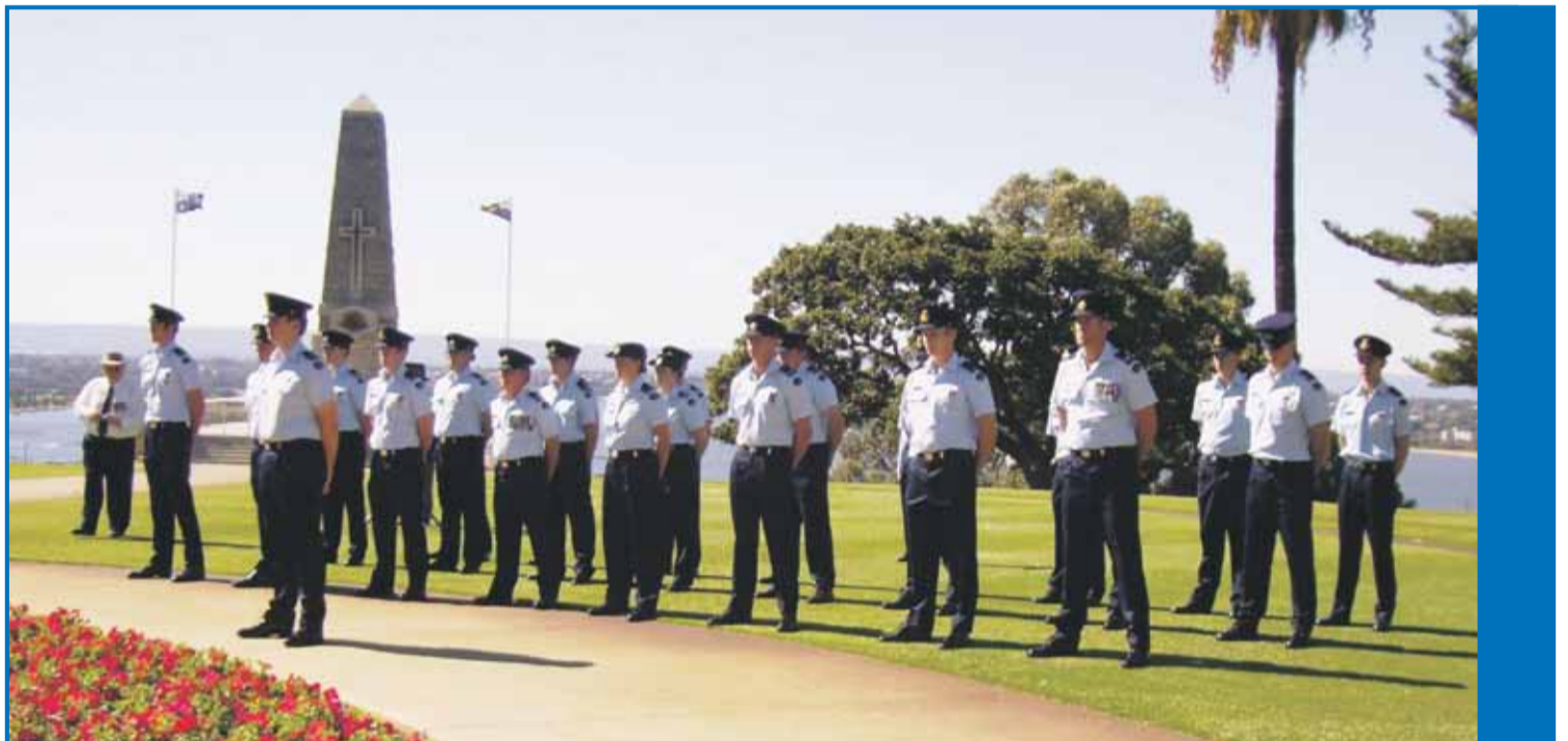
RAAF flight at the commemoration ceremony

"Today we acknowledge the valiant efforts of our predecessors. We commemorate those who lost their lives protecting Australia and celebrate the contribution that our Air Force has made to the security of Australia through operations both here and overseas".