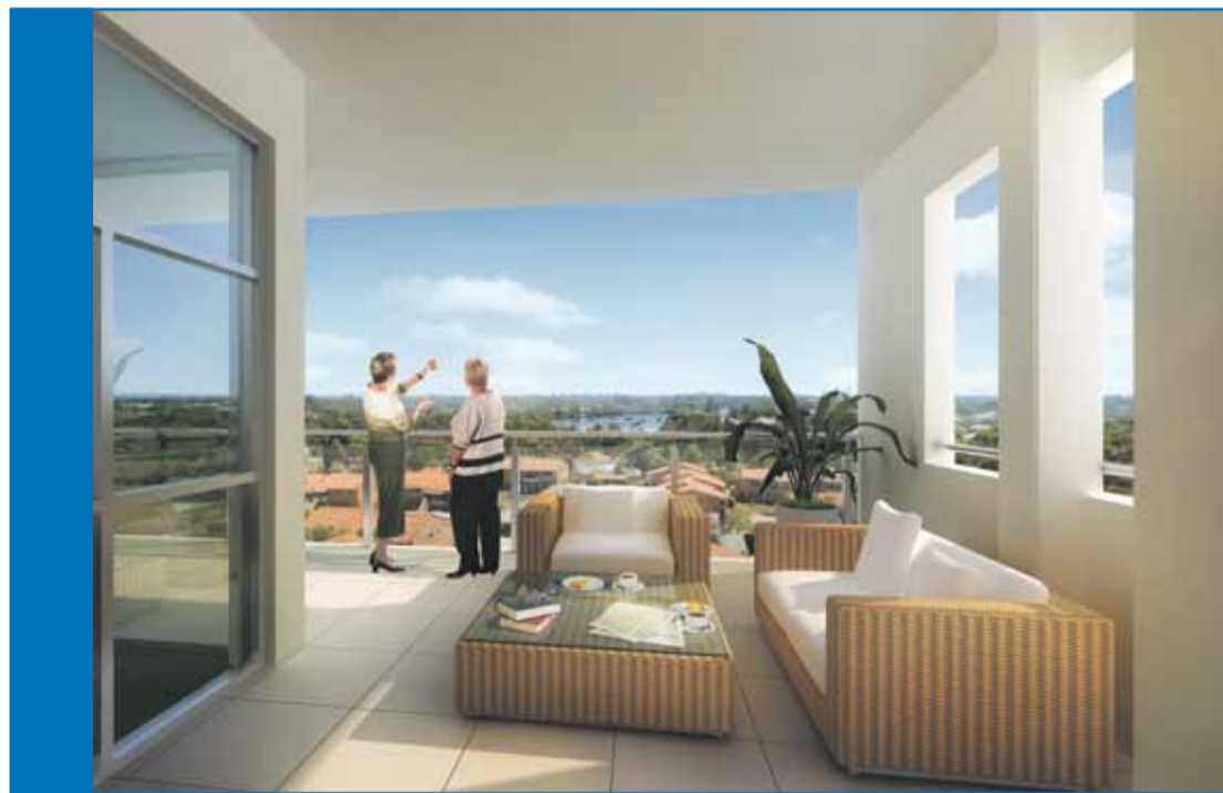
Illustration of apartment balcony

The tower crane will remain on site until it is more economical to use smaller mobile cranes to remove lower-level scaffolding.