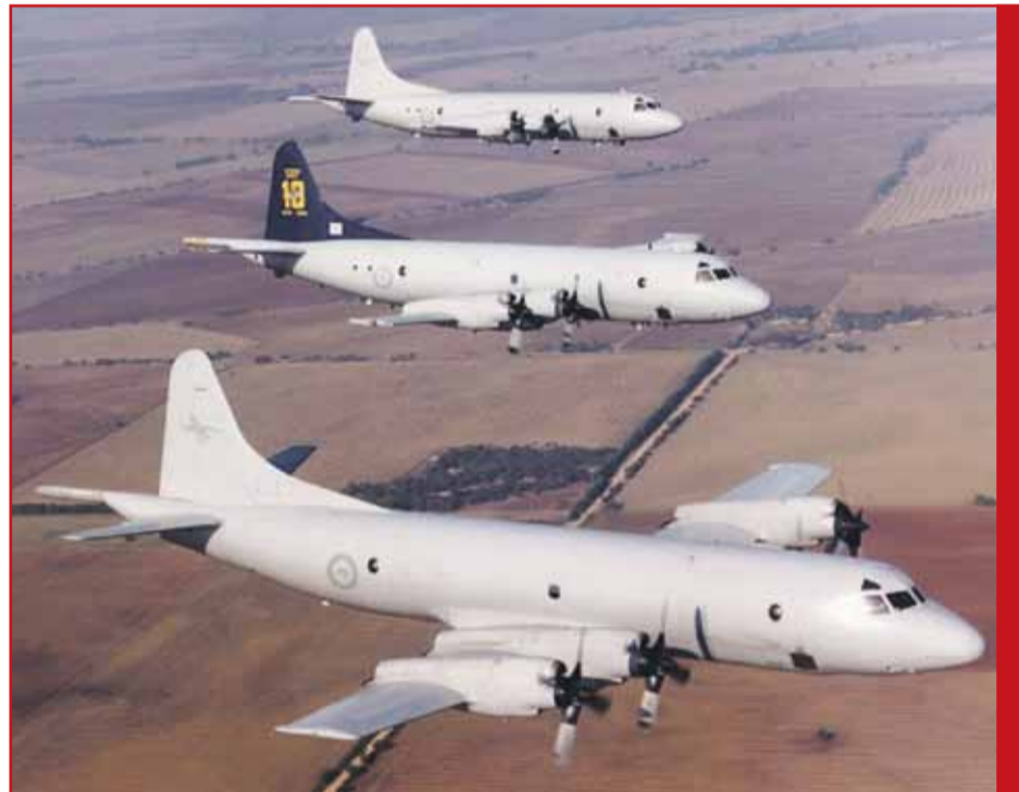
Orion maritime patrol aircraft

Orions have been operated by 10 and 11 Squadrons, and have been further upgraded with new electronic, radar, ESM systems and weapons upgrades, and are now known as AP-3C Orions.