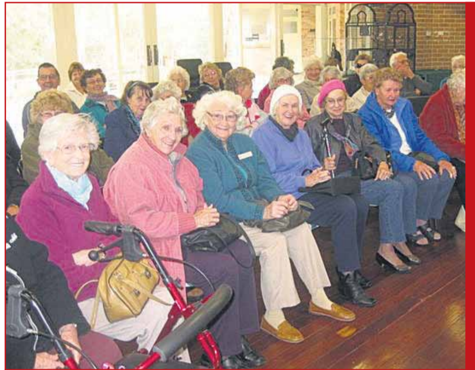
The group enjoying the talk at Kanyana