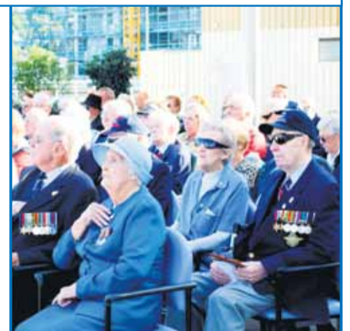
Part of the large contingent of ex-service personnel and families attending the ceremony

In all this retrospective argument we should never forget the thanks that we owe to that remarkable band of young men from every