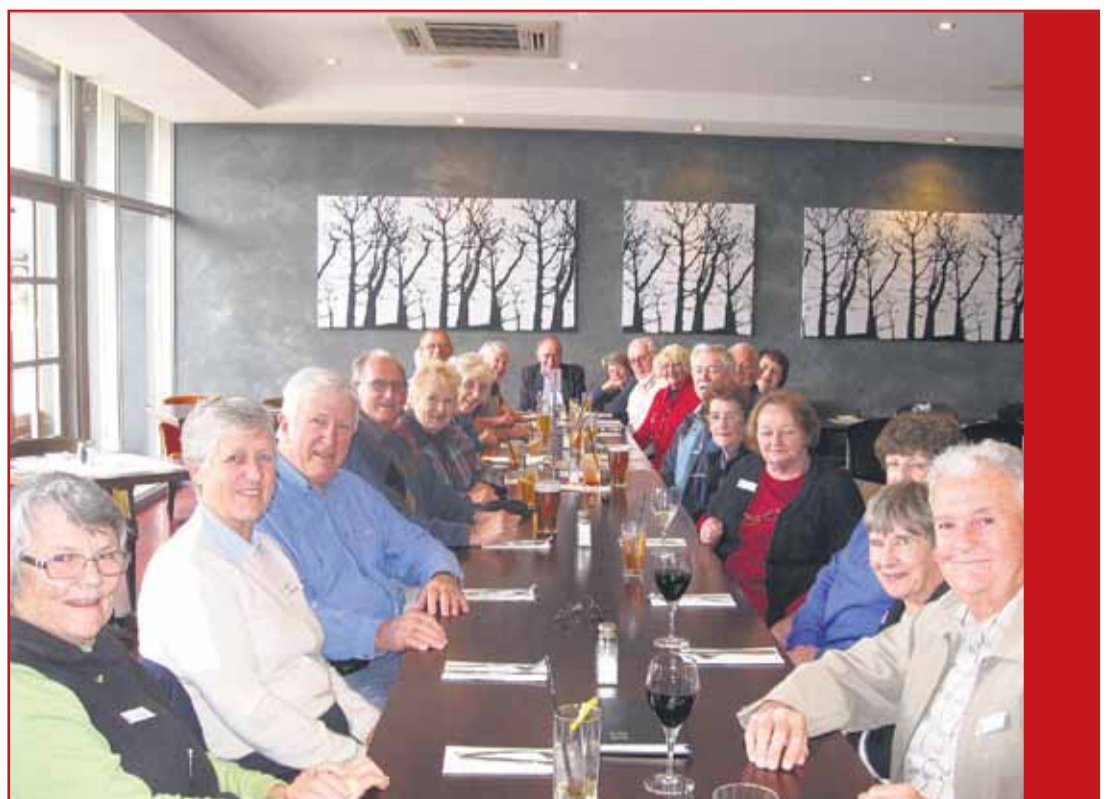
AAFC Branch members at the Grosvenor Hotel after their visit to the Perth Mint