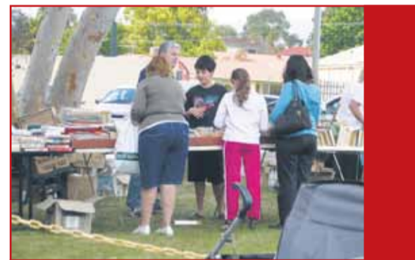
Some of the bargain hunters

Once again, the Branch witnessed some fresh volunteers, relatively new to the Mini-Mart team, but readily making themselves available. The Aviation Museum Branch can also boast a small, but dedicated core of regular patrons, eager to take advantage of