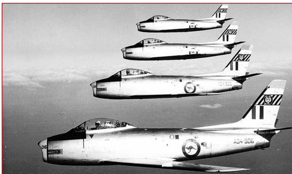
Sabres in formation

The RAAF will continue to participate in combat, peacekeeping and humanitarian operations. Its training roles are second-to-none and with the availability of modern aircraft and state of the art weaponry the RAAF will continue to be a fine-tuned, mobile and efficient air force maintaining the respect of the world's armed forces.