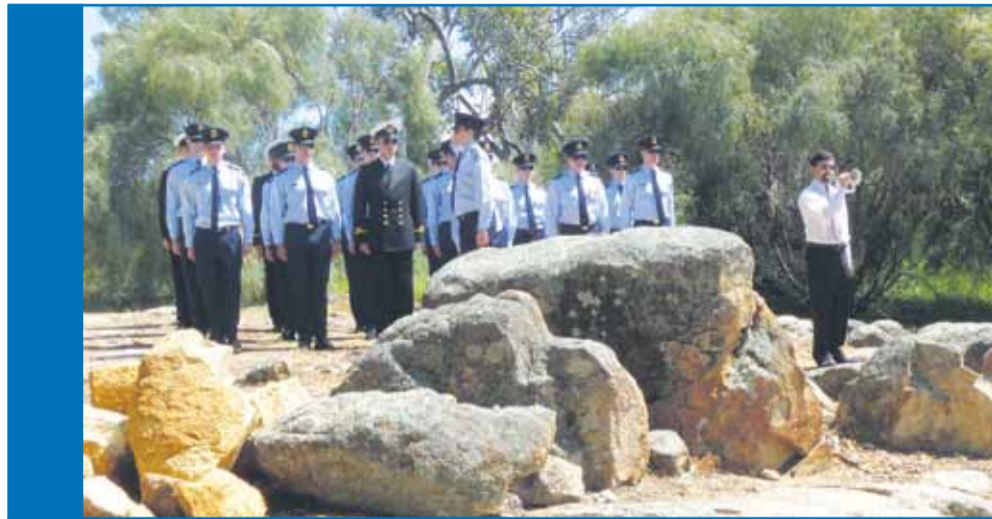
Mokine Memorial Guard of Honour

THE City of Perth Branch hosted a number of residents from Meadow Springs, Merriwa and Bull Creek Estates, family and friends at the annual memorial ceremony at Mokine on Sunday, 9 October 2011.