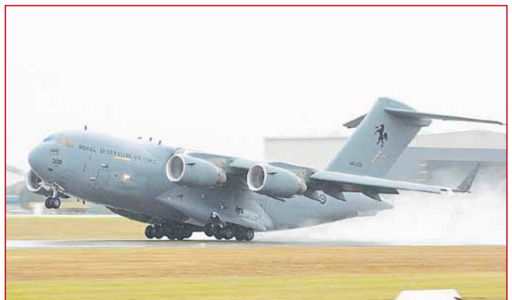
C17 Globemaster III