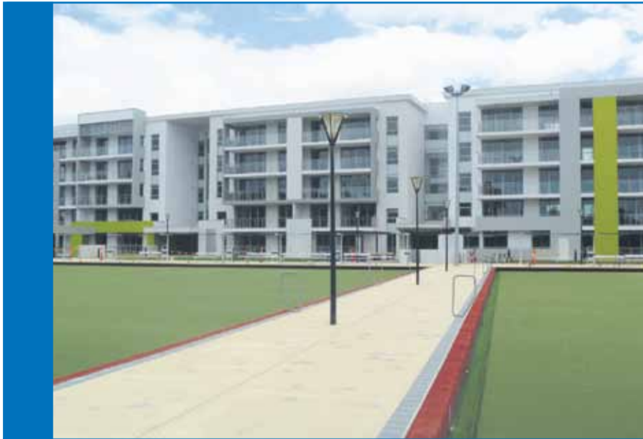
The Mirage Terraces location is a dream come true for serious lawn bowlers

EXCITED residents of Mirage Terraces have started moving into their sparkling new apartments on Air Force Memorial Estate.