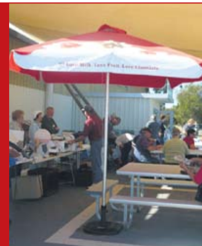
Bargain hunters at the recent mini-mart

The contribution made by the Museum and their enthusiasm can not be over estimated.