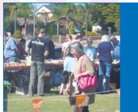
Patrons enjoying the book stall

A most sincere vote of thanks is extended to all members, volunteers and patrons who helped to ensure a very successful event.